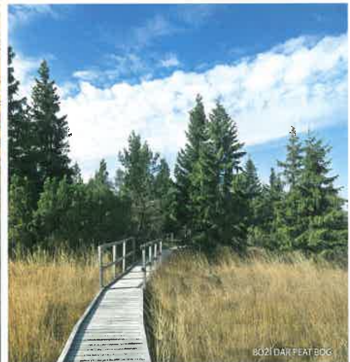
BOŽÍ DAR FEAT BOG